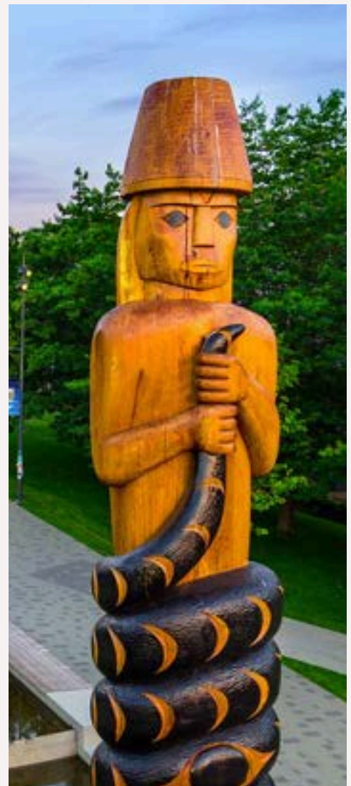
S7I:Ł QƏÝ (SERPENT HOUSE POST), BRENT SPARROW OF MUSQUEAM NATION, UBC, VANCOUVER 2016