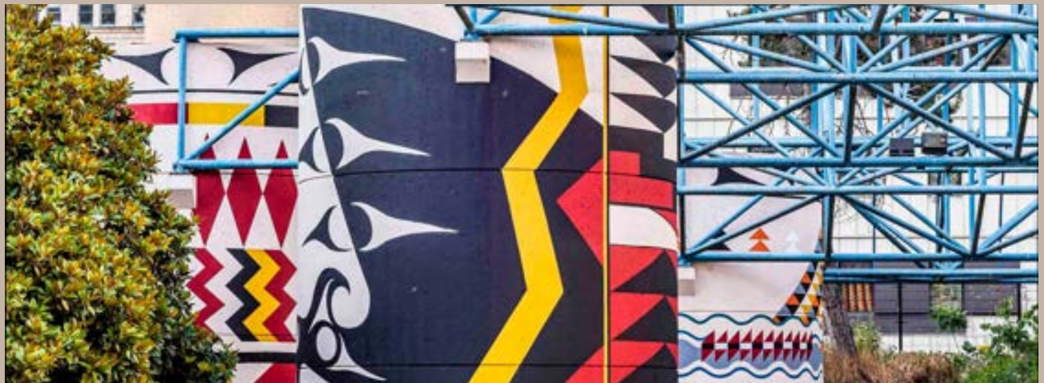
BLANKETING THE CITY, VANCOUVER MURAL FESTIVAL - DEBRA SPARROW, 2020