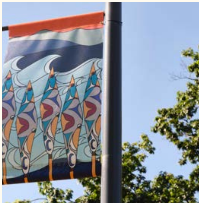
WƏL MÍ CT QPƏƏT TƏ ɁNIMƏɁ, DIAMOND POINT., 2020

The development's location in Vancouver's DTES, a heavily racialized and stigmatized area, is an important backdrop for public art at the site. Residents of the DTES should live in dignity connected to the lands and places they call home; art can be used to tell a story of community and belonging as a way to rewrite this narrative of stigma and oppression.