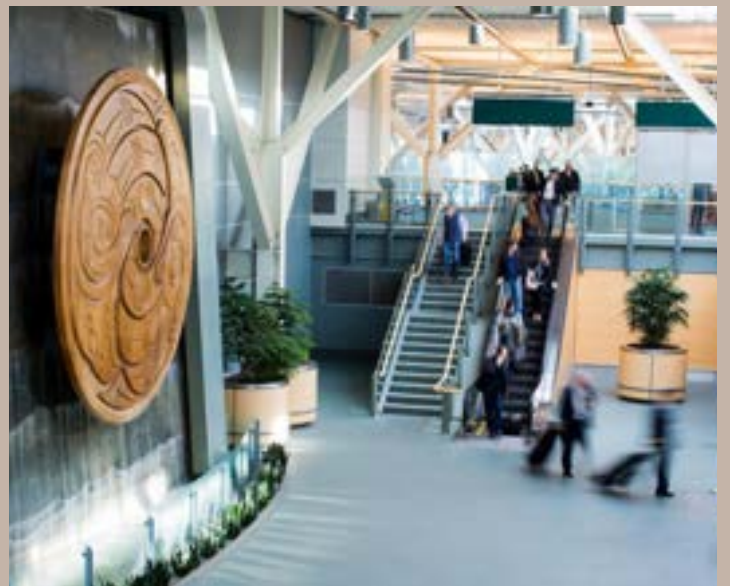
FLIGHT, SUSAN POINT, 1995