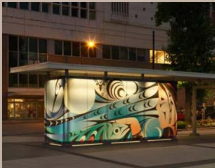
SEA TO SKY, KELLY CANNELL, 2017