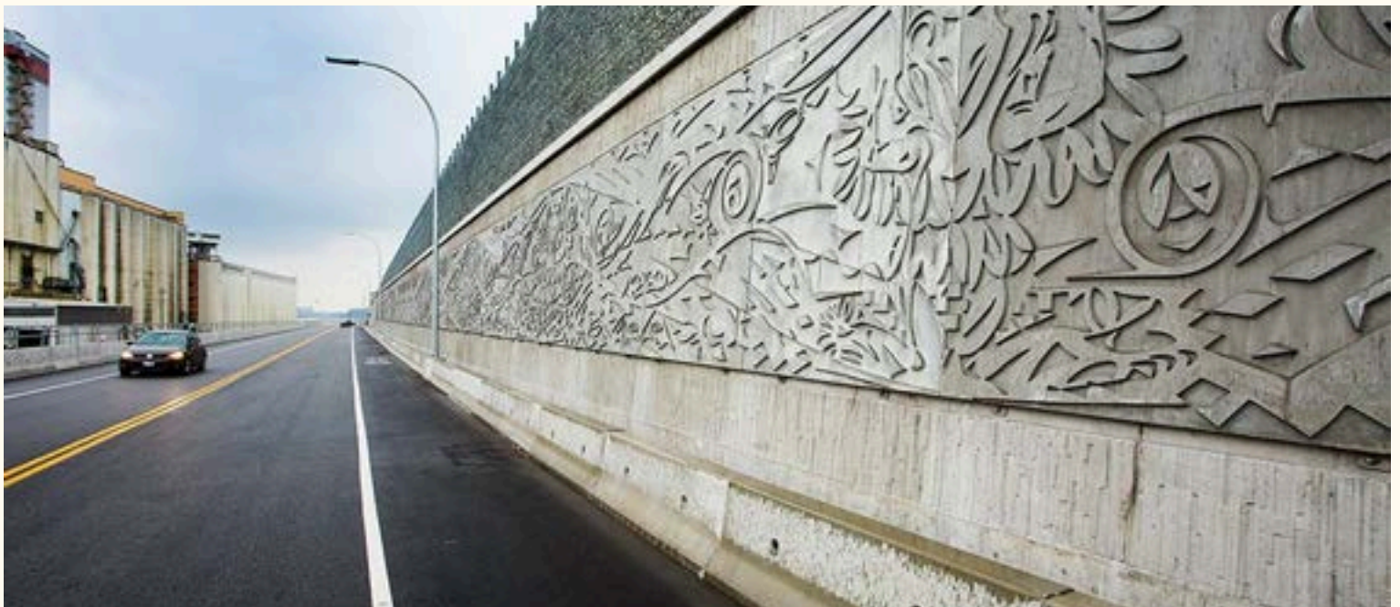
THE STORY OF LIFE, SUSAN POINT, 2014