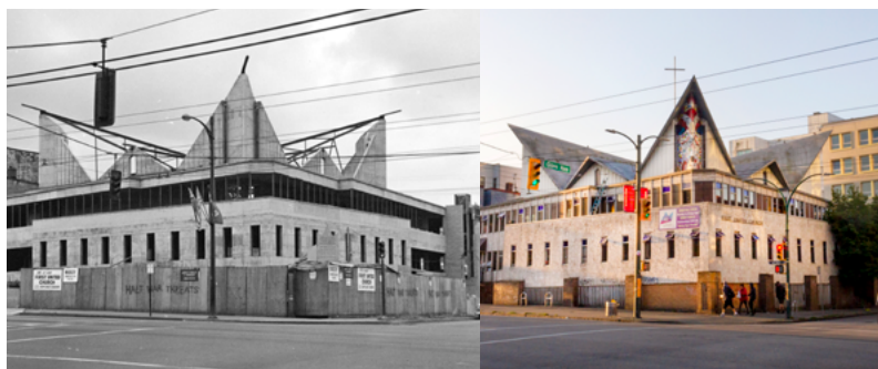
Left: The old church building as it was being constructed in 1964 (photo by David J. Martin; part of the Major Matthews Collection from the City of Vancouver Archives).

perspective, we worked with other agencies to ask the government to back a supervised safe injection site. To help move the process forward, we agreed to open a pilot site. By the fall of 2002, a room of the church was transformed into a mock safe injection site for a week. This project ultimately moved governments to provide support and since then, Insite has been credited with saving countless lives, having never had a fatal overdose within their facility, and acting as a model for other safe injection sites across the country.